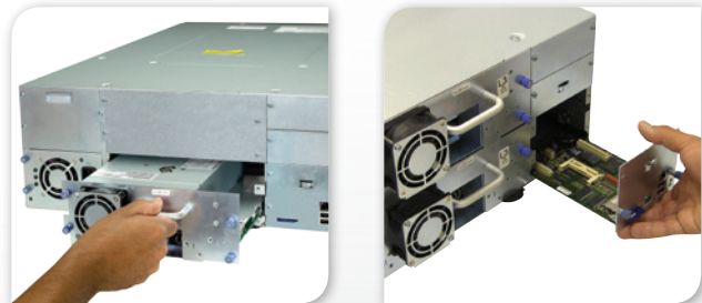
ASM enables you to replace select parts yourself.

When a component needs replacement, Spectra gives you the option to do it yourself without onsite support. ASM is an industry-first support option designed for environments where normal support services are available but not always feasible for specific customers (i.e. high-security facilities, mobile sites such as ships). ASM parts are stocked at your site, giving you the ability to make immediate repairs and eliminate any waiting periods.