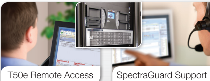
T50e Remote Access