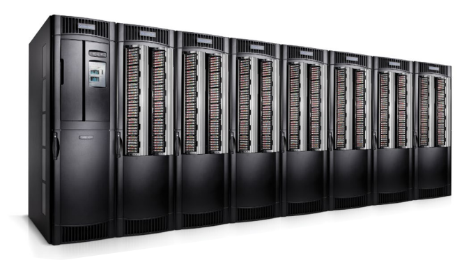
Scalar i6000 features ultra-high density and a 19-inch rack form factor, and scales from 100 to 12,006 cartridges.